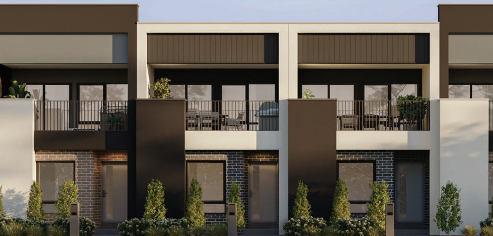
TOWNHOMES 30-39 BY NOSTRA HOMES

Where considered design meets connected living.